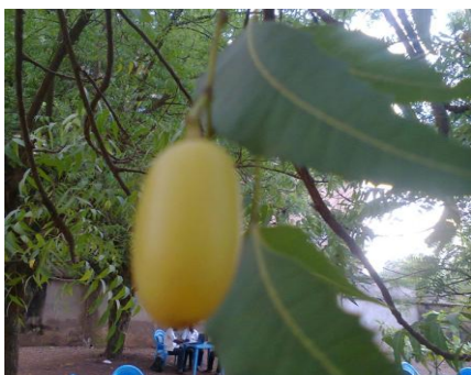
Fig 1: A Typical Fresh Ripe Yellowish-Ellipsoidal Drupe (Fruit) of Azadirachta indica (Neem).

Several plants however exist with very high nutritive value and yet remain unexploited for both man and animal benefits (Oladele and Oshodi, 2008). Fruits of plant on their own have high vitamin, mineral, fibre, phytochemical and antioxidant in their pulps and seeds of which most times are discarded due to ignorance of their nutritive value (Fila et al. , 2013). These include several wild medicinal plants like Azadirachta indica - a fast growing tree that can reach a height of 15-20 metres. This popular plant (also called Neem) is in the Mahogany family Meliaceae and a native to India, Pakistan and Bangladesh. The tree also grows in tropical and semi-tropical regions of the world. The fruit, as shown in figure 1 is a smooth olive-like drupe and varies in shape from elongate oval to nearly roundish. The exocarp is thin and the bitter-sweet pulp (mesocarp) is yellowish-white and fibrous. The white, hard endocarp (inner shell) of the fruit encloses elongated seeds with brown seed coat (Igwenyi et al. , 2014).