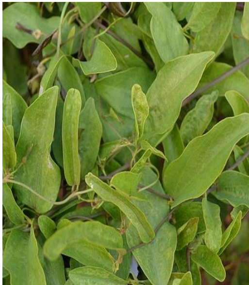
Fig -1.Plant Aristolochia indica with leaves