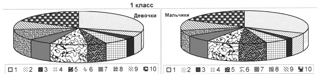
Fig.1 The distribution of children 7-8 years according to their type of posture.

1. medium 2. unbend 3. kyphotic 4. lordotic, 5. round-shouldered 6. lumbar-erect 7. lumbar-lordotic 8. cervical-erect 9. cervical-lordotic 10. pathological.