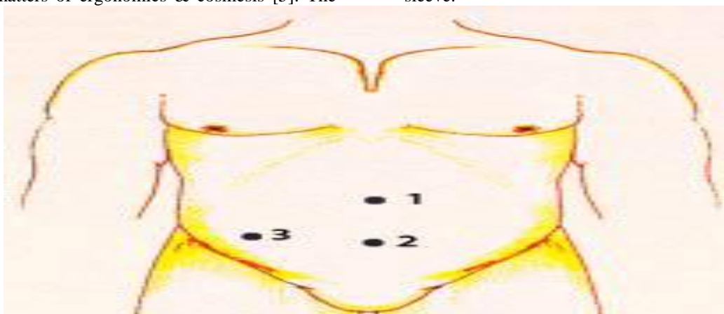
Fig-1: Port Placement

Umbilical port & right iliac fossa port was in use for the right hand instrument and instrument of left hand respectively. Retraction & dissection carried out with the method of two handed. Endobags were in use for the elimination of fat appendix whereas thinner appendixes were eliminated with the help of reducer sleeve.