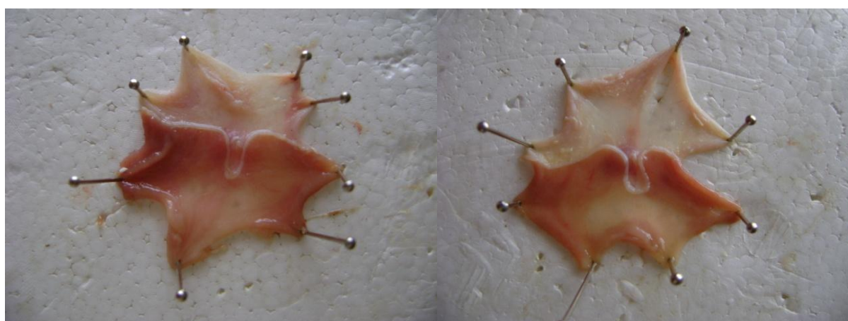
GROUP III (FDSBME 200mg/kg)