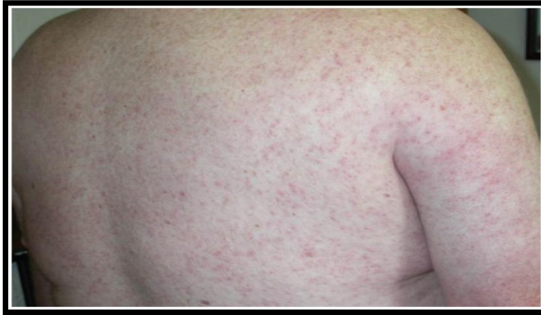
(fig 2): Diffuse maculopapular rash associated with West Nile virus infection.