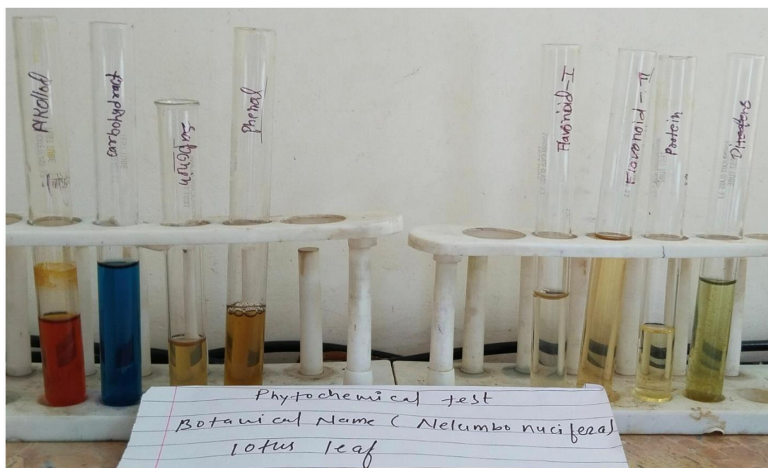
Figure 3: Phytochemical test aqueous extract of Nelumbo nucifera (leaf)