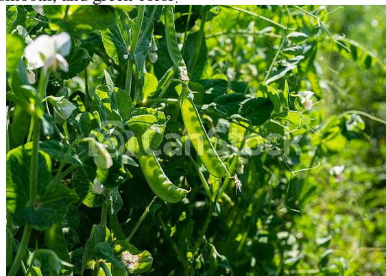
fig 1 : Pisum sativa

P. sativum is an herbaceous annual, with a climbing hollow stem growing up to 2–3 m long. Leaves are alternate, pinnately compound, and consist of 2–3 pairs of 1.5–8 cm long large leaf-like stipules. Flowers have five green fused sepals and five white to reddish-purple petals of different sizes. Fruit grows into a pod, 2.5–10 cm long that often has a rough inner membrane. The pod is a seed container which composed by two sealed valves and splitted along the seam which connects the two valves. Seeds are round, smooth, and green color. [3]