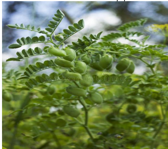
Fig 4 : Cicer arietinum

Chickpea ( Cicer arietinum L.) of Fabaceae family is the third most vital food legume of the world. Chickpea seeds are predominantly consumed due to its protein composition. One of the seed proteins albumin is reported to possess medicinal properties including antioxidant, antihyperlipidemic and antiproliferative. It is a source of functional peptides too. [14]