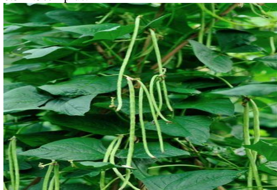
Fig 5 : Vigna unguiculata

Cowpea ( Vigna unguiculata ) is one of the most popular legume seeds. It has similar physical and chemical properties as common beans ( Phaseolus vulgaris ), except for its fat content. Cowpeas contain around 9–10% fat, whereas common beans have only 0.5–1.5% lipids. [16]