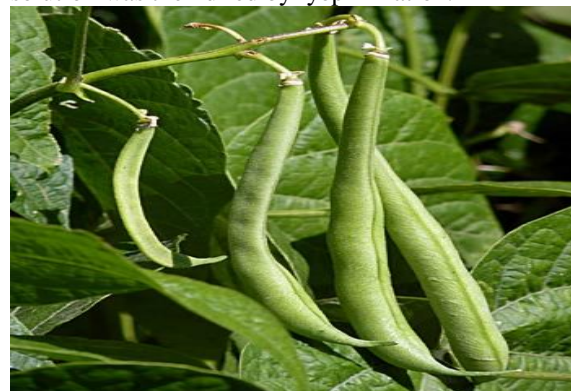
fig 3 : Phaseolous vulgaris

The Black Bean Extract was prepared as described by Gutiérrez-Urbe et al. 10 , whereas the Flavonoid Fraction was obtained by dissolving 2 g of dried BBE in 20 mL of methanol followed by sonication for 5 min, then 20 mL of tri-distilled water was added and homogenized by sonication for 5 more min. The blend was centrifuged at 800 g for 5 min and the supernatant was recovered. The flavonoids were purified using a C18 Solid Phase Extraction cartridge 20 cc/5 g followed by a washing step with 10 mL of 25% MeOH, and the flavonoid-rich fraction was recovered by eluting 10 mL of 60% MeOH. The flavonoid solution was then dried by lyophilization. [8]