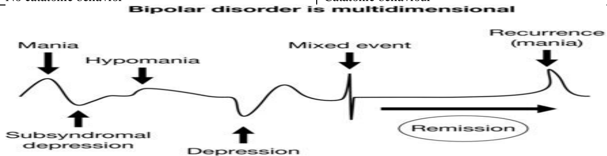
Figure 1: RANGES OF MOOD DURING BIPOLAR DISORDER