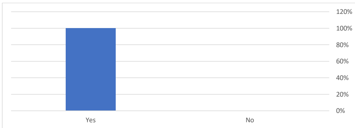
Figure No.1: Opinions and attitudes of participants regarding the importance of nursing in the health sector,through helping patients needs