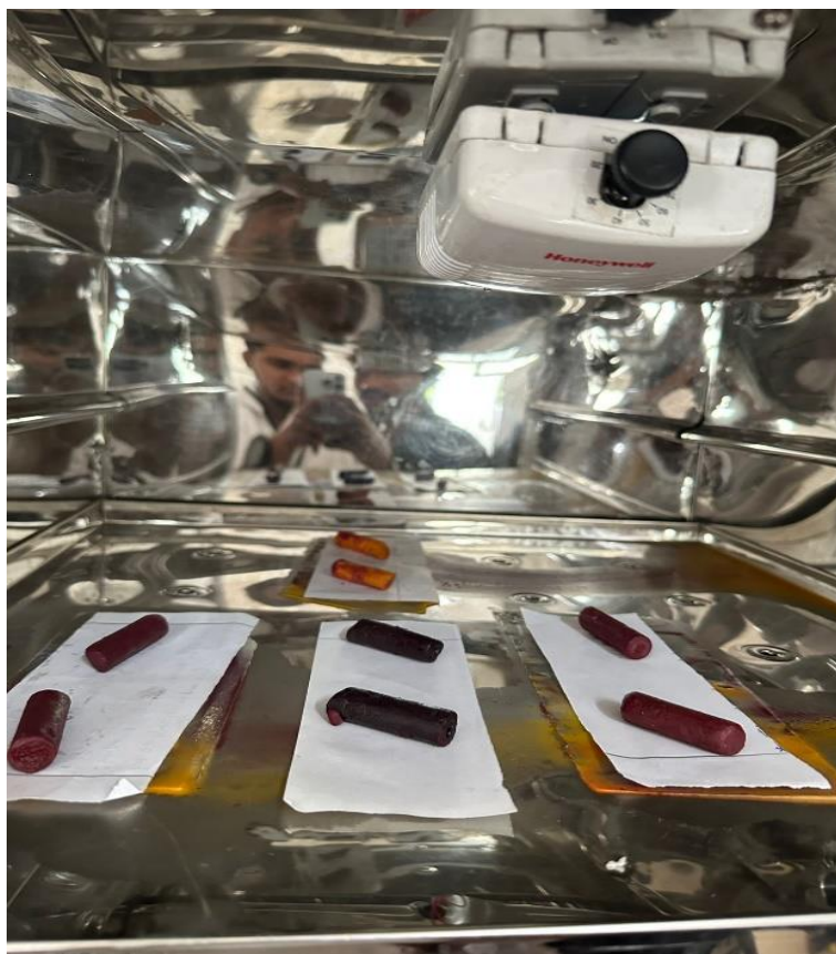
Fig no: 2 lipsticks formulations HL1, HL2, HL3, HL4

The results have been tabulated in the table no. 2 and the stability study conducted using stability chamber shown in figure no.2.