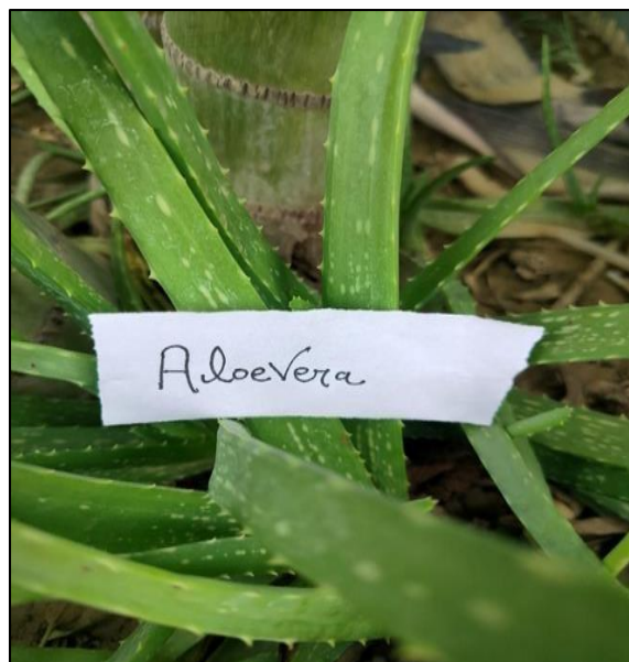
Fig 2: Aloe-Vera [18]

Glycerine relieves scalp irritation quickly. Aloe vera soothes sun-damaged skin and hair. Organic Aloe vera fades skin blemishes and rashes. Aloe vera retains moisture, while glycerine brightens skin and hair.