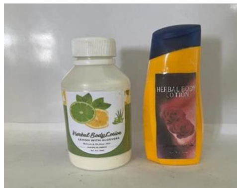
Fig 3: Prepared Formulation

The herbal body lotion was evaluated to various parameter such as physiochemical parameter, pH, wash ability, irritancy, homogeneity, viscosity, smoothness, etc., used to check the quality and performance of formulation. The effect of different ingredients in the formulation was.