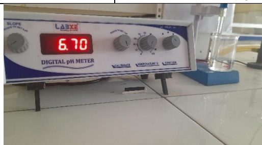
Figure 2: pH Determination