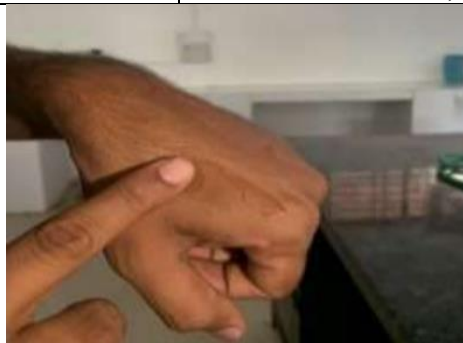
Figure 4 :Abrasiveness