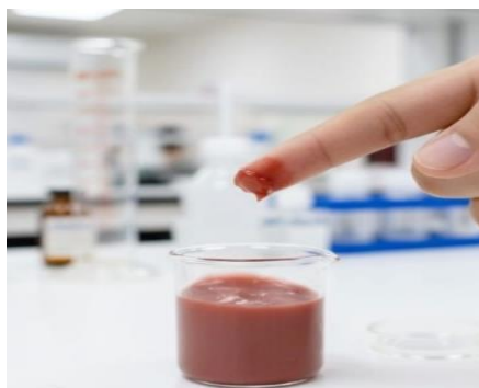
Figure 1: Homogeneity

All formulations (F1, F2, and F3) were found to be homogeneous , with uniform distribution of herbal ingredients and no visible lumps or phase separation.