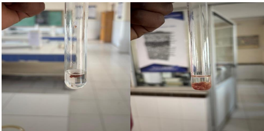
Figure 5: Solubility in water