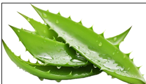
Fig 5: aloe vera