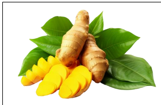
Fig 4: turmeric

Common name: turmeric, indian saffron, curcuma.