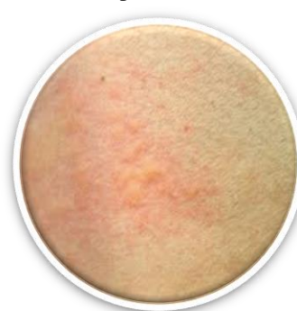
Fig 2: skin inflammation

Increased blood flow to the affected area, feeling warm to the touch, fluid buildup in the tissues, discomfort or tenderness, common in many inflammatory skin conditions, visible changes in skin appearance (bumps, blisters, scales etc).