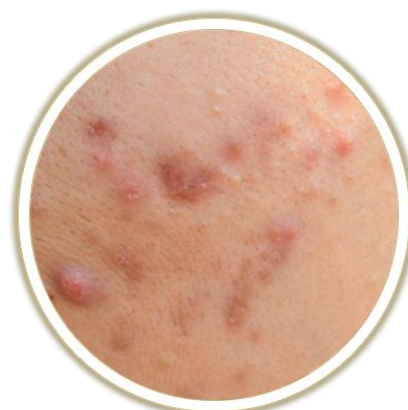
Fig 1: acne

Blackheads (open) and whiteheads (closed), red bumps (papules), pus-filled bumps (pustules), larger painful lumps and deep primarily on the face, neck, chest and back.