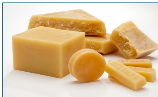
Fig 7: bee wax

Common names: beeswax, cera flava (yellow beeswax), cera alba (white beeswax)