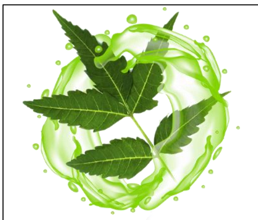
Fig 3: neem leaves