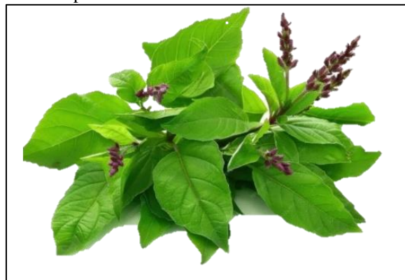
fig 6: tulsi